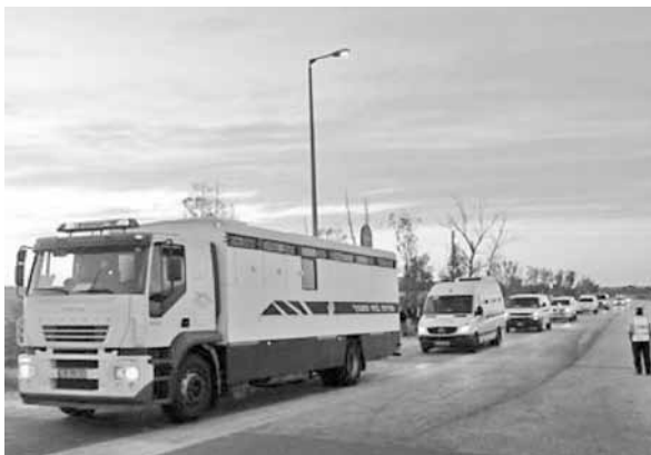
Nahshon buses transporting prisoners and detainees

The transfer bus is divided into two parts: 1) the driver's cabin, where he is accompanied by a Nahshon Unit member, 2) an armored box that can hold up to 46 persons. This section is referred to as the "black box."